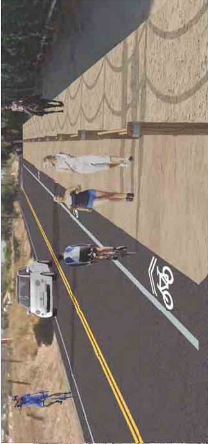
EXISTING 2+ THRU 3+ THRU 4+ THRU FROM GRAND AVE TO PALOMAR ST (TYPICAL)